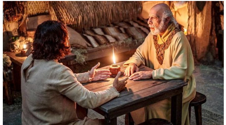
Jesus invites Nicodemus to a new life. Jesus invites all people to something new!

Did Matthew leave just like that to follow Jesus? Matthew (9:9), Mark (2:14), and Luke (5:27-28) tell us that Matthew left everything after Jesus said, “Follow me.” What took place is not known, but the show helps us to imagine the drama of that moment!