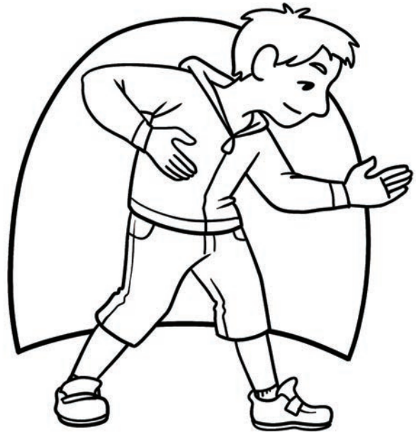
Break Dance: Robot

Bring your heels together and make a "V" with your feet. Bend your knees.