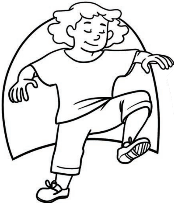
Hip Hop: Stomp

Move robotically—stiff and precise movements.