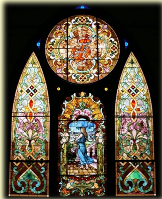
First United Methodist Church McKinney, TX 75069 (972) 562-8556

O God, let your eternal light illumine our paths without and shine on our hearts within, forever. Amen.