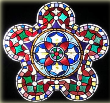
Rose or Star

Traditionally the rose is seen as the “eye of God.” When centrally located in the front of the church, the window becomes the portal that “guides” the ship, the Divine Light piercing the darkness without and illumining the soul within.